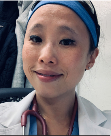
UI College of Nursing