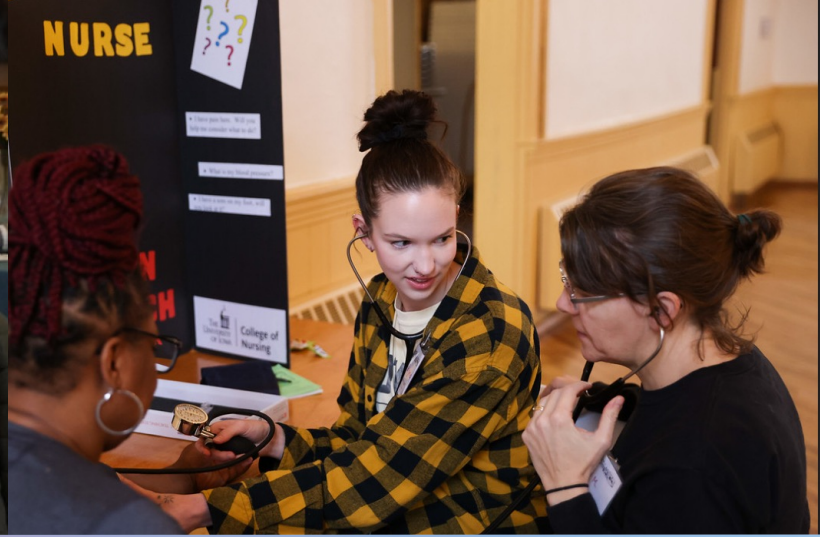
Agape Café and the undergraduate students